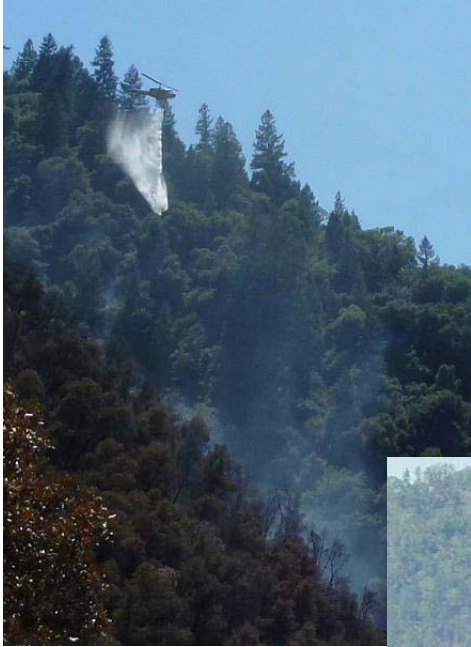
Photos from the Robbers Fire in NEU.