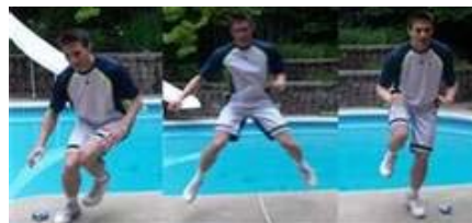
Side to Side jumps